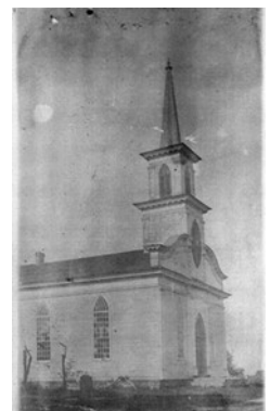
The church was on Silsbee Road